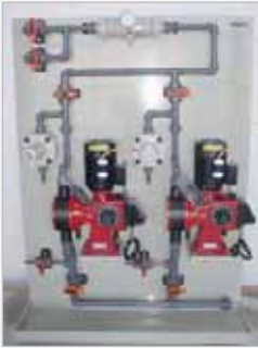
Plate-mounted standard dosing systems