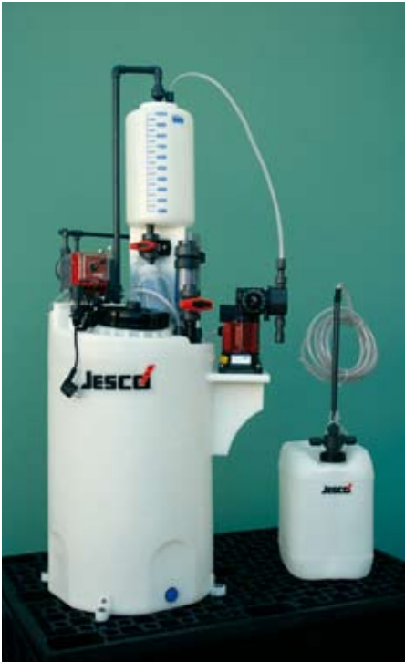
Semi-automatic ammonia dilution station

If liquids are dosed when they are diluted, it usually involves particularly aggressive, corrosive or health endangering media. Apart from polymers, examples are hydrazine and ammonia liquor. Before they are used, the liquids are reduced to a less dangerous concentration or to one that is specific for its intended use. Both substances are mainly used in power stations or other steam systems.