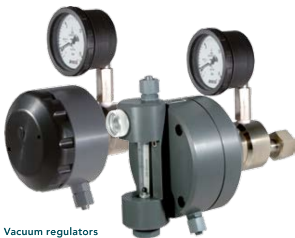
Vacuum regulators C 2213 and C 2214

significantly reduced with the use of piping systems in negative pressure. When the piping system works with negative pressure, possible leakages immediately interrupt the flow of the medium.