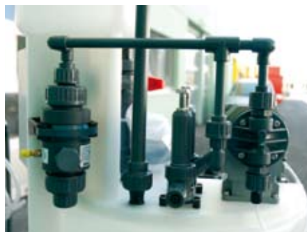
There is the option of inserting a snubber to even out the fluctuations in pressure

It is possible, thanks to the dosing technology of Lutz-Jesco, to dilute such highly concentrated substances quickly and simply. The ammonia solution is, for example, pumped from a supply unit via a suction line with vapour return and over a motor driven MINIDOS diaphragm dosing pump until it reaches a dosing device. Water is simultaneously fed into the storage container via a water dilution connection. The air displaced therein travels to the outside through the activated carbon filter or a vent pipe. The quantity calculated for the desired concentration is measured on the scaling sintered in the storage container and dispensed via a manual ball valve into the dilution container. The mixture is homogenized with a manual agitator and finally dosed into the system with a MAGDOS DX magnetic dosing pump. The MAGDOS can be controlled in proportion to quantity by using a standard signal or with a continuously adjustable natural frequency. Either way, a safety valve should