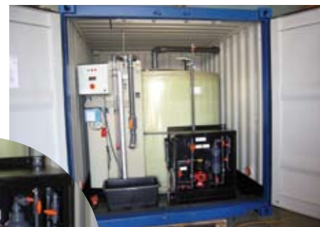
Dosing-container PWT 5.9 with Lutz-Jesco dosing technology

The mobile "5 feed" storage and dosing container "PWT 5.9" for the dosing stations, which were developed by the Thielemann company, are certified under the Water Resources Act. They are built by the Anlagentechnik Thiel company from Wasbek. The Thielemann company uses the sturdy and reliable dosing technology from Lutz-Jesco to dose the iron salt solution. The process uses motor driven diaphragm