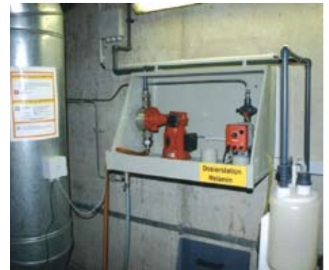
HELAMIN dosing station

There are further products from different suppliers used for conditioning water, especially in the power station sector. That is why we built some dilution dosing stations, for example, for the HELAMIN company. The operation sequence resembles